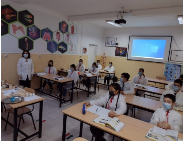
The science Lab