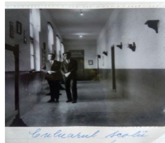
In the school