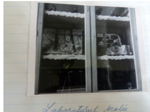
The science laboratories