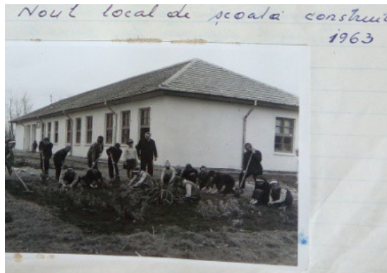
The school in the year 1963

In the year in which the village of Gheorghe Lazar was founded (1884), there was the need for establishing a school. The school operated in a rented house in the community. In 1969 a new school building with five classrooms was inaugurated, a teacher's lounge, to which were added two more rooms in 1970, rooms that became laboratories.