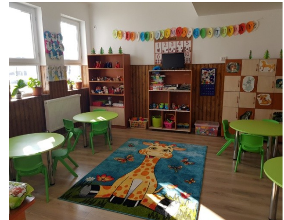
A class in The Kindergarten