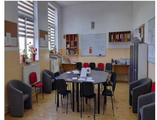
The Teacher's lounge