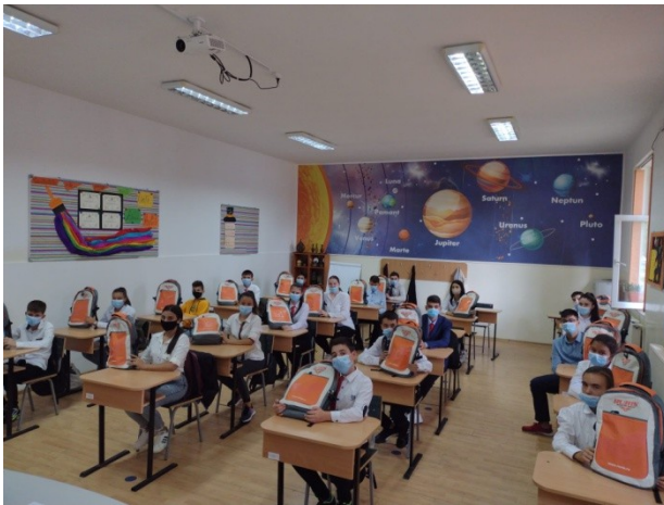
The History and Geography Lab