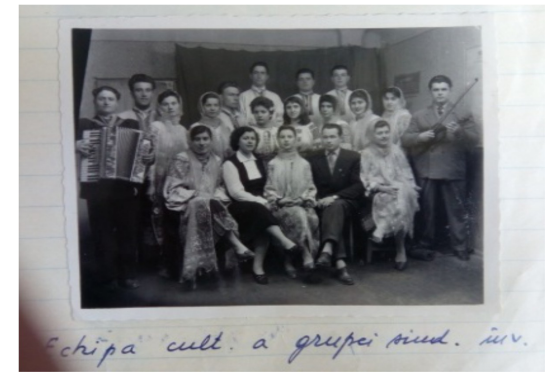
The school's cultural team